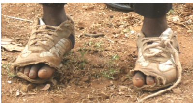
Haven't the orphans suffered enough?

The country is suffering under an 80% rate of unemployment. So even if the orphan has a distant relative, there really is